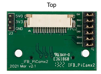
Figure 1: Dual Raspberry Pi Camera Connector Daughter Card

Learn more: Refer to the Dual Raspberry Pi Camera Connector Daughter Card Schematics and BOM for the part details and schematics.